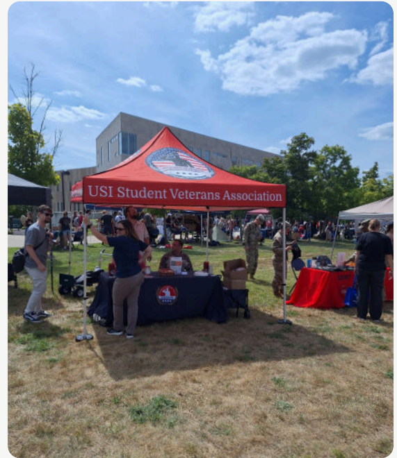
Club & Activity Corner