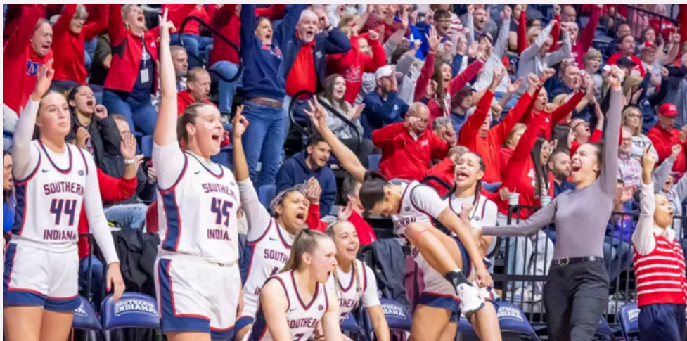
USI fans celebrates the Lady Eagles Basketball team in the NIT Tournament in the Liberty Arena. The excitement of hosting the game(s) and the success of the women's team brought a pride to campus.

Meetings for the Student Veteran Association are held the first Friday of each month. Veterans, current serving and dependents of veterans are all welcome!